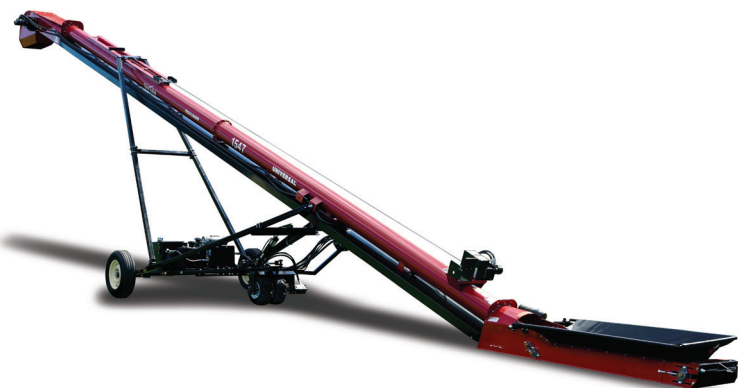
1547 Field Loader with Gas Powered Self-Propelled Kit

Portable belt conveyor with a gas or diesel drive self-propelled kit. The Self-Propelled Kit features a self-contained hydraulic self-propel package that allows control of all field loader functions, including steering to easily maneuver and drive your Field Loader across the ground. It also allows hydraulic running of the belt and raising and lowering to the appropriate filling height, all from the same valve as the steering and propel functions.