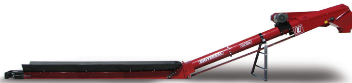
1500 Series Pit Conveyor

Custom built Tube Conveyors for a wide array of applications and requirements. Designed to accommodate bulk material handling and gentle, efficient transfer of grain and seed.