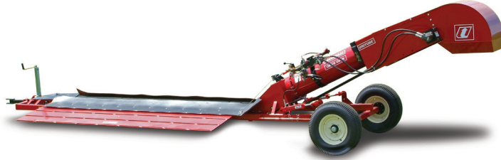
2200 Series Drive-Over Conveyor

Get your grain trucks back to the field quicker with our Drive-Over Conveyors. Our Drive-Overs save time with easy positioning and optional hydraulic controls to raise and lower the hopper, for better material containment.