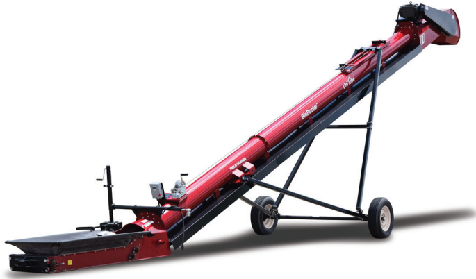
1800 Series BinBuster®

A Field Loader conveyor best suits your needs when you need a longer reach with low clearance, such as unloading hopper bottom trucks or bins.