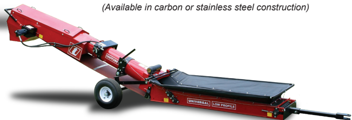
Low Profile Transfer

(Available in carbon or stainless steel construction)