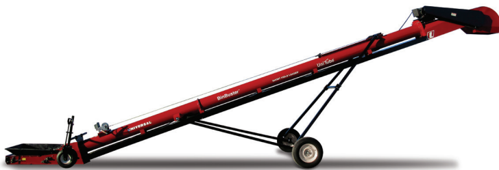
1800 Series BinBuster® Short Field Loader®

The Short Field Loader® features a low clearance tail, that fits more easily into tight spaces. These units are shorter than our standard Field Loaders and used for unloading in compact or inflexible areas.