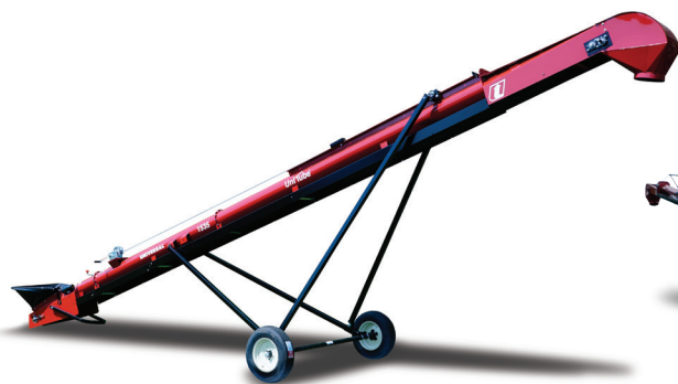
1535 Tube Conveyor

Engineered for gentle handling of seed and grain , the standard Tube Conveyor features a collapsible hopper, perfect for loading and transferring commodities into bins, trucks, and trailers.