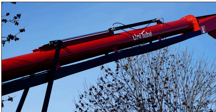
Hydraulic Lift Cylinder