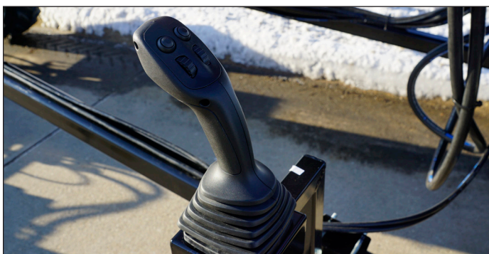
Joystick with Manual Override