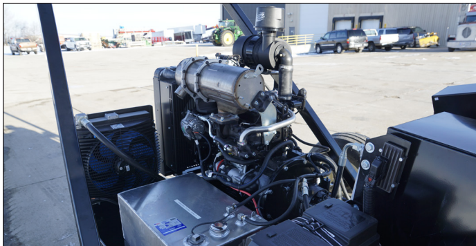
45HP Tier IV Final Yanmar Diesel Engine and Hydraulic Cooling Package