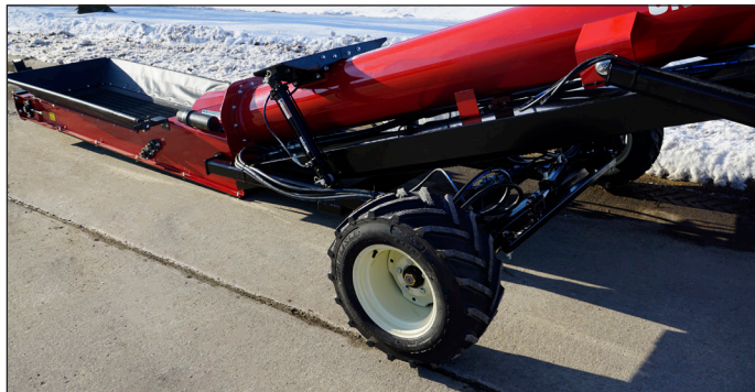
Hydraulic Wheel Mover Kit with Brake Motors