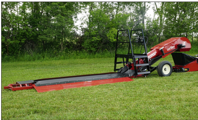
2200 Series Drive Over with Full 12' Hopper and Deck Length

The Whole Grain System® integrates a 2200 Series Drive-Over to quickly unload your trucks with a 2200 Series Tube Conveyor.