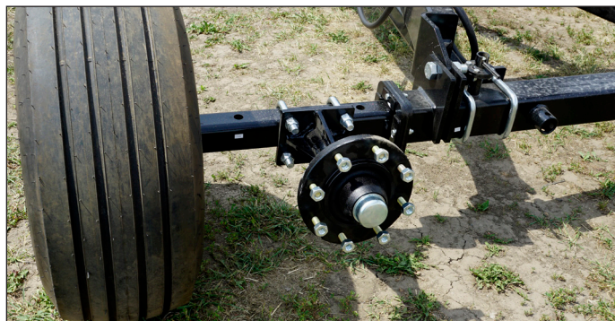
Extendable Axle and 90° Spindle

Specifications are subject to change without notice.