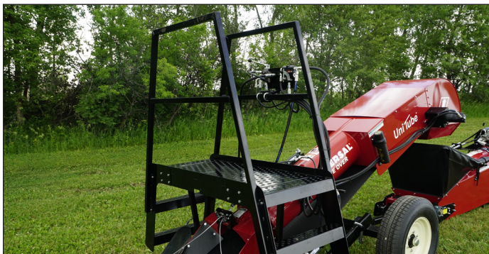
Control Drive Over and Hydraulic Flaps While Standing on Walkover Platform

The Whole Grain System® integrates a 2200 Series Drive-Over to quickly unload your trucks with a 2200 Series Tube Conveyor.