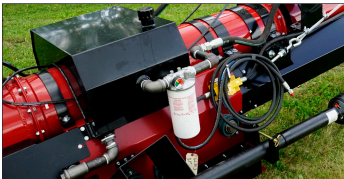
Self-Contained Hydraulic System to Power Drive Over Conveyor