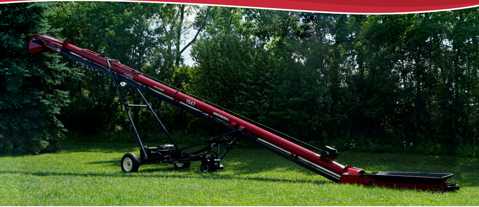
Model 1547 Tube Conveyor (Shown) 1537 & 1547 Short Field Loader® & Field Loader