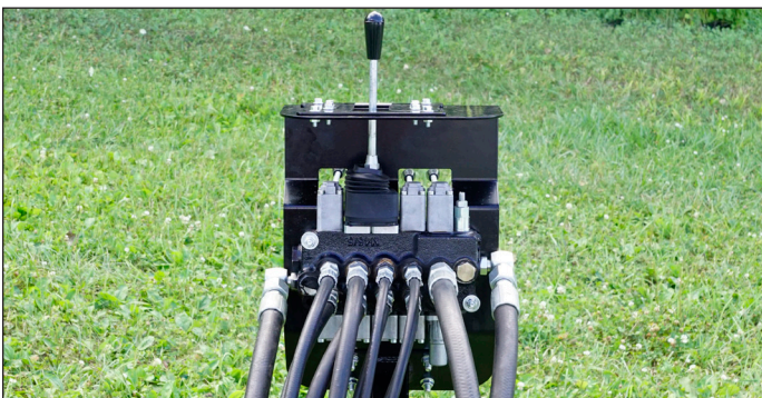
5 Spool Valve to Control All Hydraulic Functions