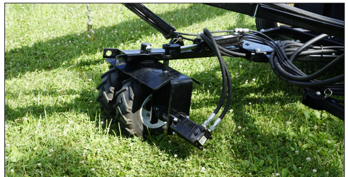
Hydraulic Wheel Mover Kit