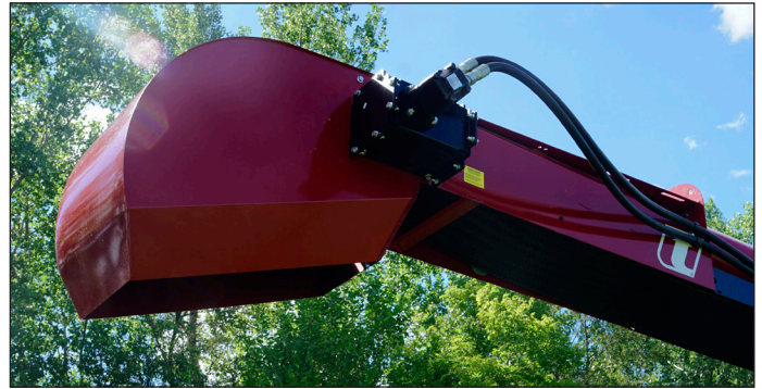
Hydraulic Top Drive (No V-Belts or Sheaves)